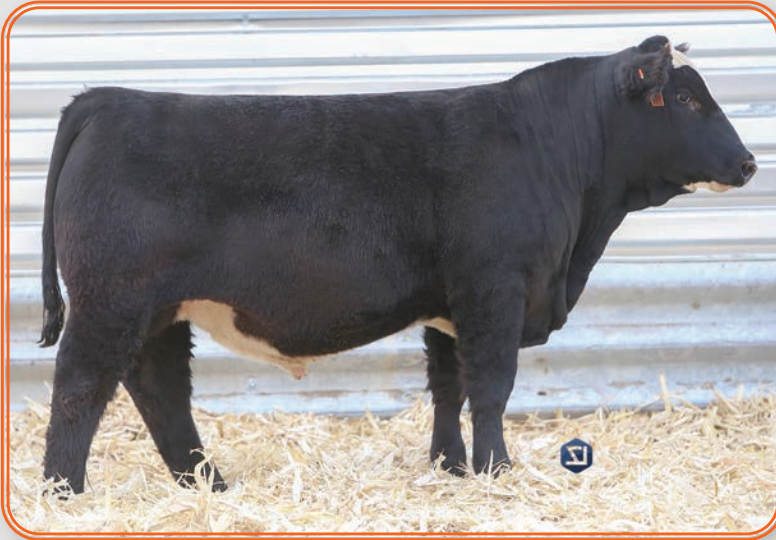
TAG 279 - KRJ K279