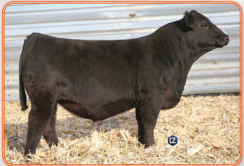
TAG 273 – DJF K273

This bull came in and posted the #2 WW of the natural born calves this year! Good CE and TI in the top 25%.