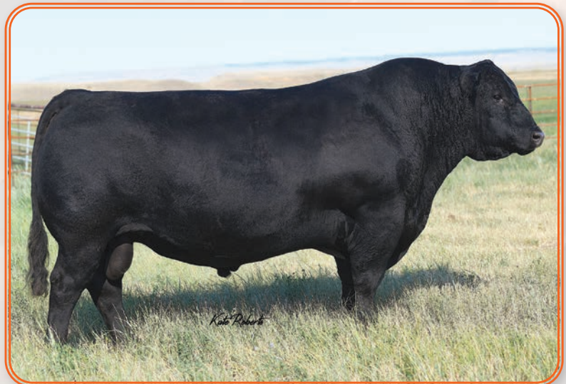
SYDGEN ENHANCE— SIRE

Enhance son with all purpose index in the top 25% as well as a 4.13 ADG.