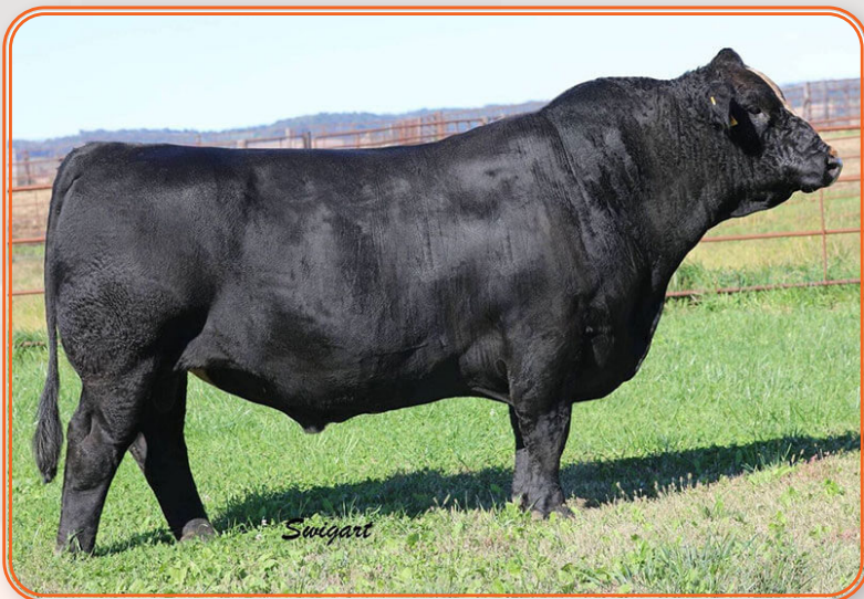
WBF SIGNIFICANT B132 – SIRE

This BWF bull's dam, lot 41, has produced 3 maternal brothers in past sales.