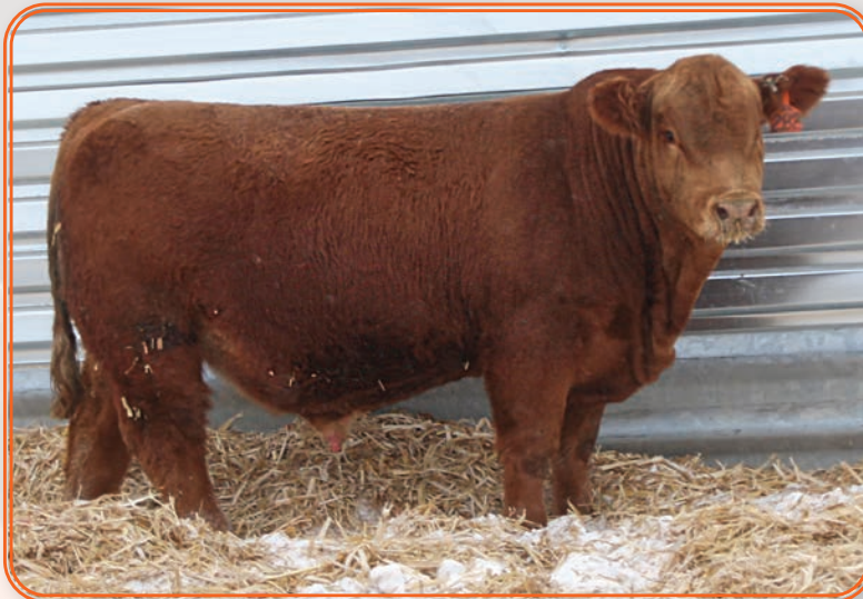
TAG 282 - KRJ K282

BWF bull that is following in the footsteps of his grandam, lot 54, with WW and YW in the top 5%!