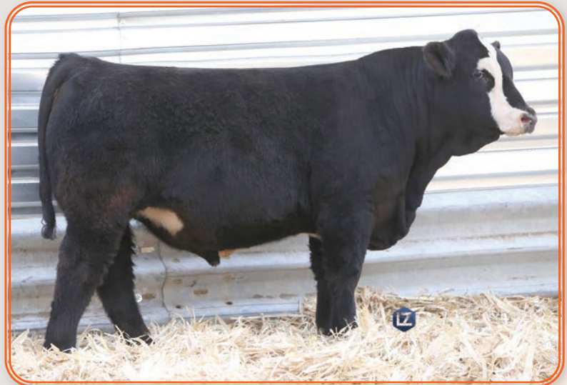
TAG 221 – KRJ K221

Black white faced bull with weaning weight, yearling, and carcass traits in the top 10%! Grandam sells as lot 45.