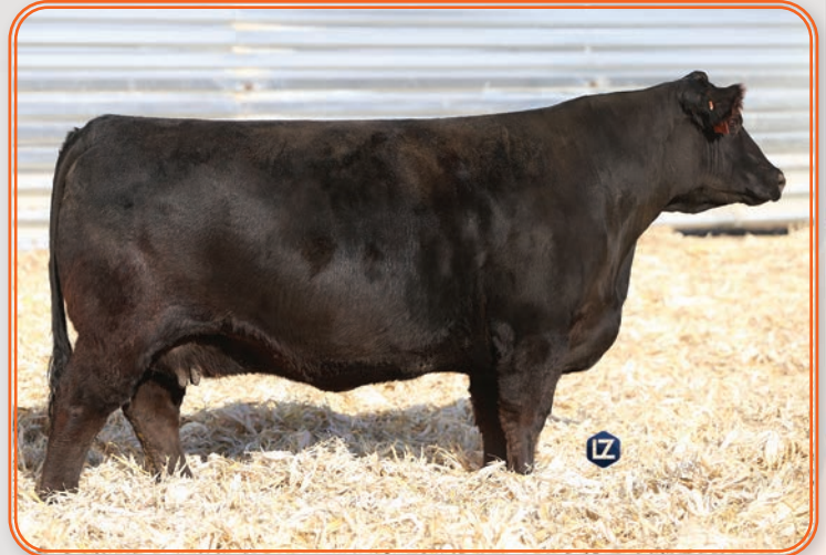
LOT 47 – KRJ B4118