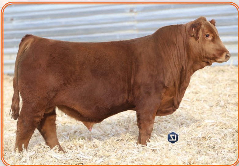
TAG 234 – KRJ K234

A red bull with an outcross pedigree that combines good growth, maternal, and carcass traits with a 4.07 weight per day of age!