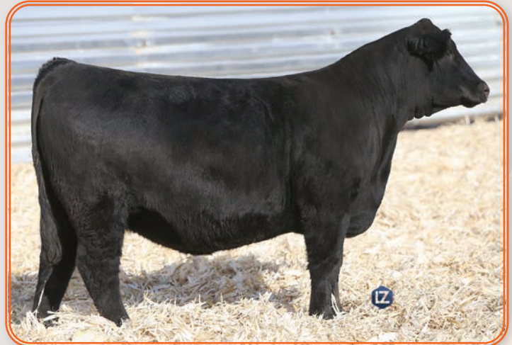
LOT 11 – DJF J1177

LOTS 11-14: These bred heifers are the last of the legendary T739 donor who was recognized as one of the most prolific donors by the ASA. T739 has topped the sale here for many years and was known for her unmatched growth. Full sibs to Lot 12 have topped previous sales as bulls and bred heifers. Bred up to our Golden Book herd sire who has 12 EPDs in the top 15% and 7 in the top 5%. These females and matings are stacked with great genetics!