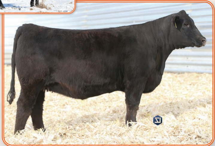
LOT 12 – DJF J1151