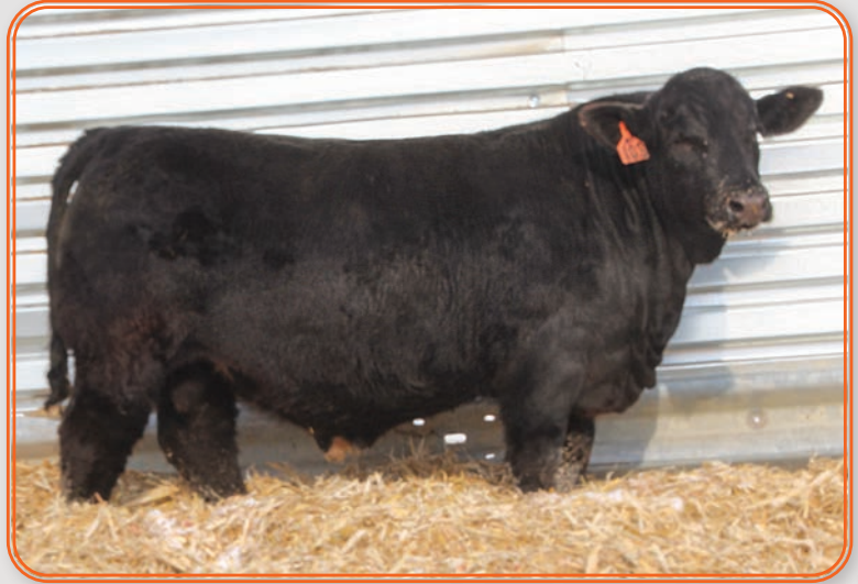
TAG 201 – KRJ K201

A stronger aged bull that ranks in the top 2% and 3% for YW and WW with great carcass traits and TI in the top 5%.