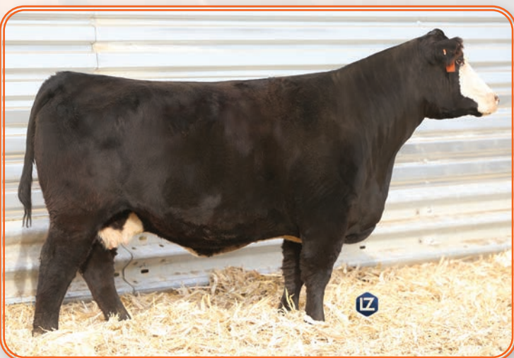
LOT 45 - KRJ ALL THAT B4133