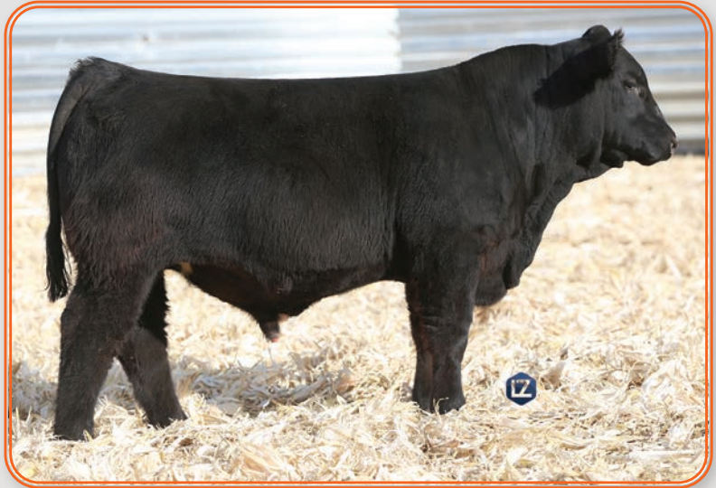
TAG 2106 – DJF K2106

Larger framed, performance oriented bull with solid numbers across the board as well as pushing the scales to our #6 WW ratio and #4 YW ratio as well as #4 WDA of 4.31!