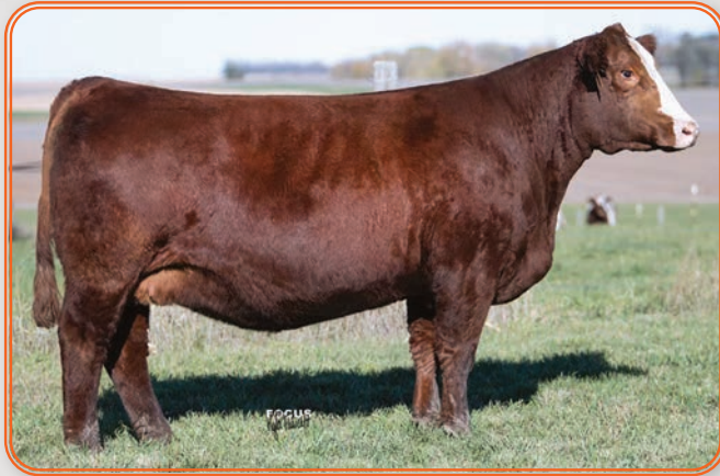
LOT 6 - KRJ HOT TAMALE F8157