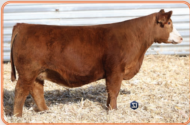
LOT 7 - DPS MISS NIBS J1195