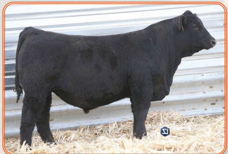
TAG 245 - KRJ K245

This large framed, good growth bull comes in with high carcass traits and a 4.34 ADG. His dam sells as lot 28.