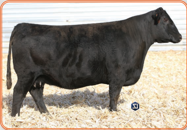
LOT 15 - DOUBLE J MISS C5131

This mother daughter combo gets my heart pumping with their breeding potential like no other! With Lot 15 being dual registered as an angus and bred to Pays to Believe, the calf in her belly is highly anticipated. If Lot 16 wasn't in the sale, she was be the next candidate to enter into our donor pen as her Outlaw bull, K285, this year came in as our top YW bull. She has also posted a 106 WW ratio on 3 calves and a 105 YW ratio on 2. It will be fun to see what these two produce in years to come!