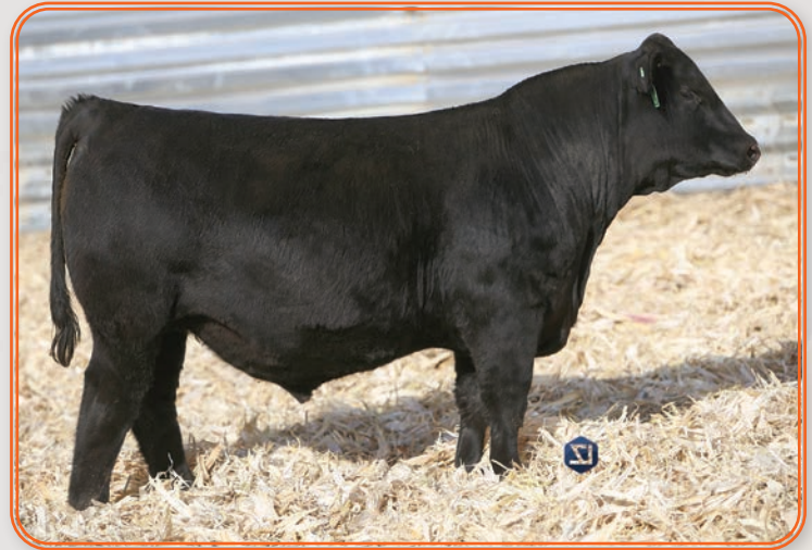
TAG 227 - LONG U HOME TOWN K227

Cow bull here with 18 EPDs in the top 25%! Good footed bull with .91 Marb, 1.00 RE, 78 $M, 315 $C.