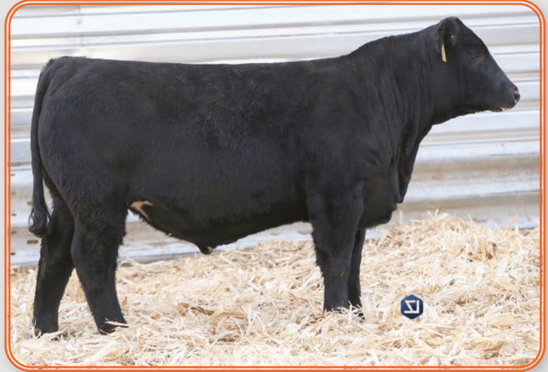
TAG 218 – DJF K218

Potential heifer bull that shows us a good spread from birth to yearling. Posts a 4.34 ADG.