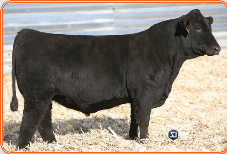
TAG 2174 – KRJ K2174