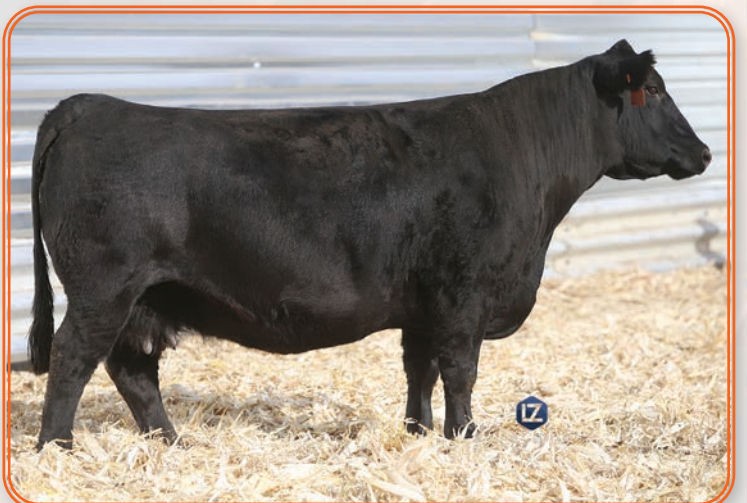
LOT 49 – KRJ B405

A.I Sire (5-10-22): KRJ Dakota Outlaw G974 Due: 2-17-23 Pasture Sire (5-14 to 7-1-22): KRJ Grade 8 Bolt J153