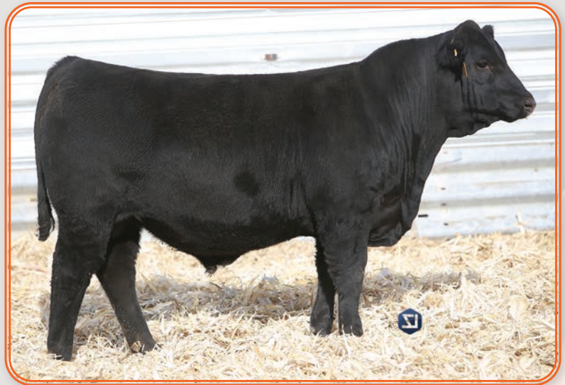
TAG 272 – DJF K272

Growth oriented bull that has ADG in the top 3%, CW in the top 4%, and Marb in the top 20%!