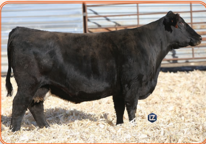
LOT 54 - DOUBLE J MISS Z228