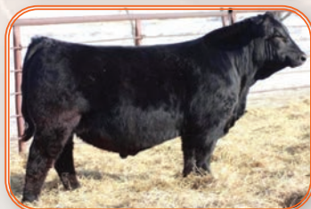
W/C REVOLUTION 65G EMBRYO SIRE