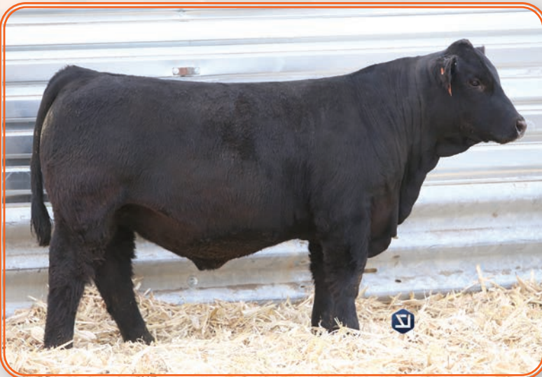
TAG 215 - KRJ K215

12 EPDs in the top 25% with API in the top 15% and TI in the top 10%! Out of a first calf heifer.