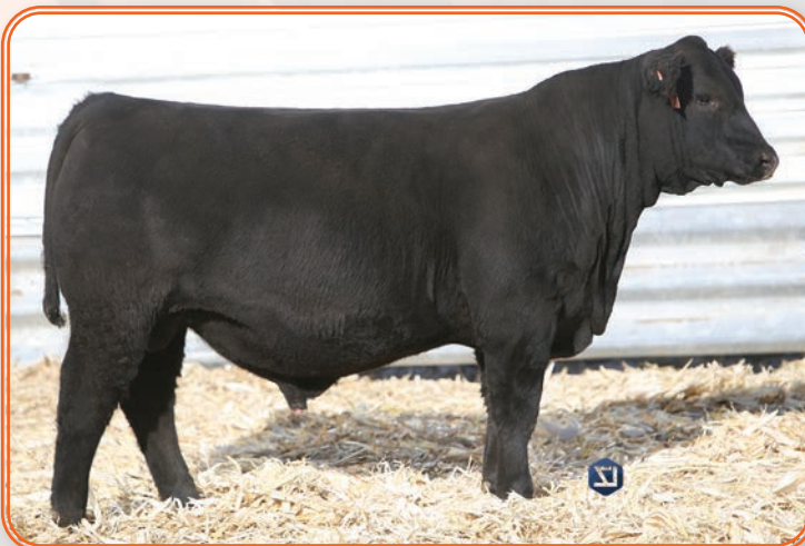
TAG 243 – KRJ K243