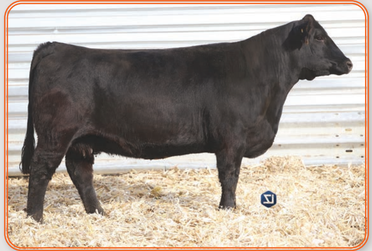
LOT 27 - DJF G952