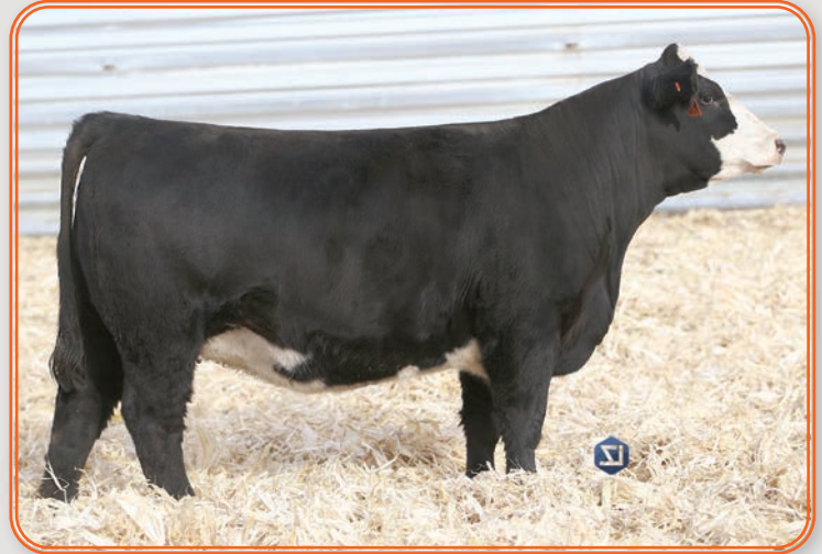
LOT 18 - KRJ J115