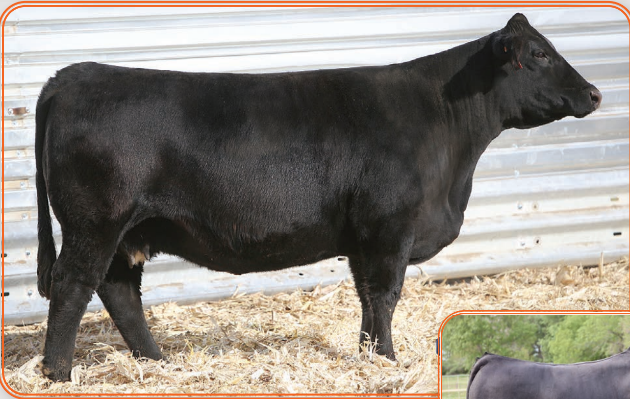
LOT 1 – BRKC DAPHNE DY37