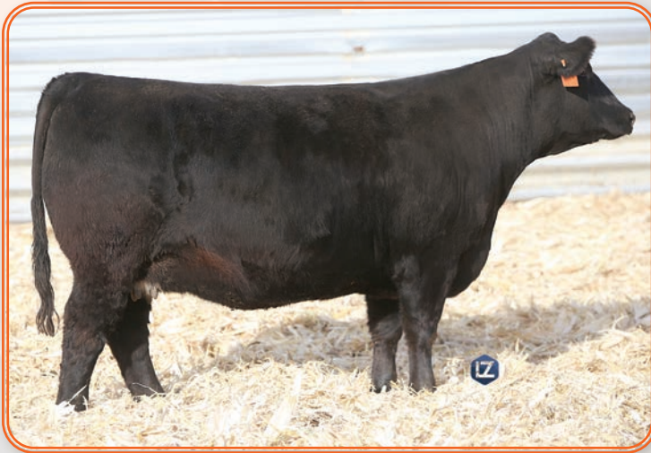
LOT 16 - KRJ F8108

KIPP JULSON || Cell 605-351-9088 || Sale Day Landline 605-594-2310 View our videos online early in the New Year at www.DVAuction.com