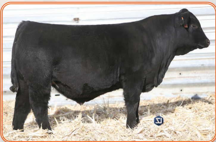
TAG 2102 - KRJ K2102