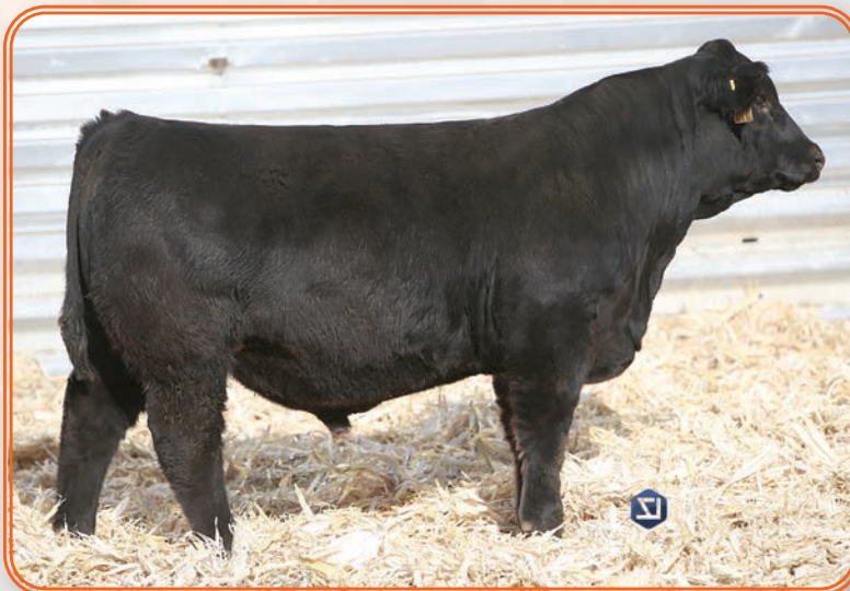
TAG 283 - DJF K283

Red herd sire prospect ranks in the top YW and WW, milk, and carcass EPD traits. Posts a 4.32 WDA and a natural calf out of the donor dam Darling, lot 10. His full ET brothers are 2156, 2160, and 2163.