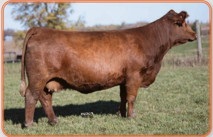
LOT 10 – OMF/DK DARLING D49

Darling came into our donor pen after producing KRJ Direct Impact selling to Dakota Express and her next bull selling as a herd sire to Lehrman Family Simmentals. Direct Impact calves have been well accepted in the seed stock industry topping a couple sales across the country. Darling's Round Up bulls in the sale are a very impressive set of red embryo transplants that we have raised. She has been flushed 5 times with a 22 egg average at Trans Ova! The success of this cow family has just begun!