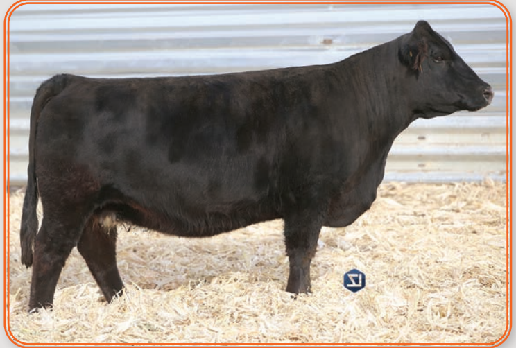
LOT 36 - DJF D645