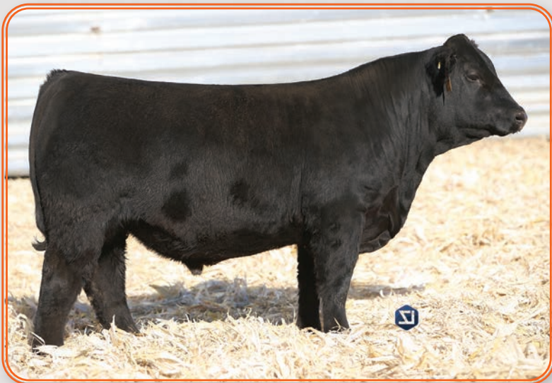
TAG 229 – DJF K229

Potential heifer bull with well balanced EPDs and a great cow family to back him up.