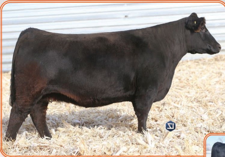
LOT 24 - DJF H070