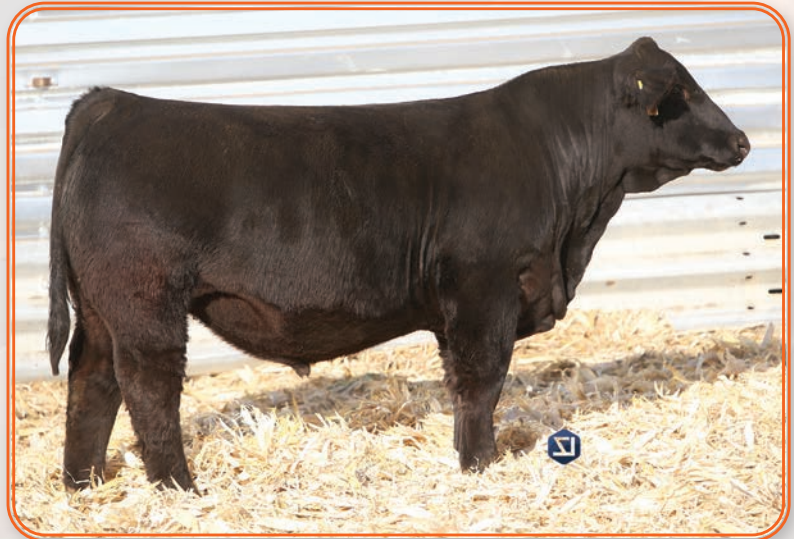
TAG 287 – DJF K287

A bull with a good spread form birth to yearling with his dam being our top WW heifer in 2018!