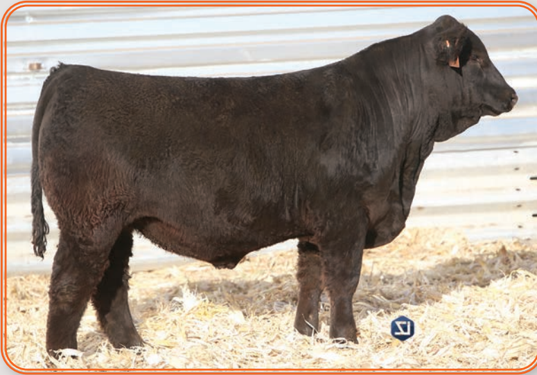
TAG 254 - KRJ K254