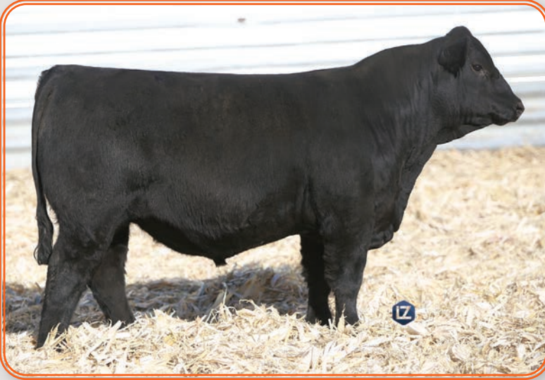
TAG 210 - KRJ K210