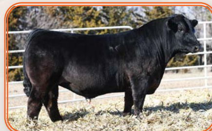
MR SR 71 RIGHT NOW E1538 EMBRYO SIRE