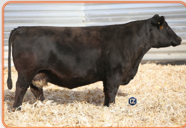
LOT 33 - DJF D698