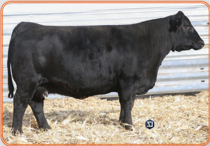
LOT 32 - DJF D6115