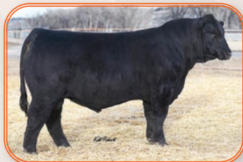
LBRS GENESIS G69 EMBRYO SIRE

Daphne is the mother of Dakota Outlaw who was our high selling bull in 2020 for $31,000 to Bietelspacher Ranch with many top seedstock producers utilizing him. Outlaw has sired a son for Bietelspacher's called Next Level that sold to Boyert-Core and Buck Creek Ranch. Jesse James, a full brother to Outlaw, sold last year to Heartland Simmentals for $16,000. Daphne produces eye appeal, body depth, and maternal traits with fault free genetics for growth. She sells in her entirety along with the first 3 daughters ever offered as well as very impressive sons, K2170 and K2174. She has been flushed 6 times with a 13 egg average. This is an investment that is sure to generate income!