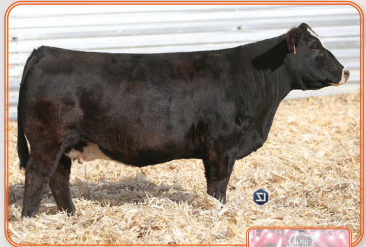
LOT 5 – NPC GLITZ AND GLAMOUR C519