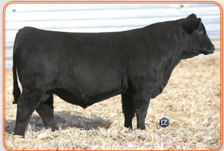
TAG 2170 - KRJ K2170

A full brother to Dakota Outlaw and 2174. With 2170's 1576 lbs at Adj YW, he came in as our #3 bull for ADG at 4.93! Very complete, well-balanced bull!