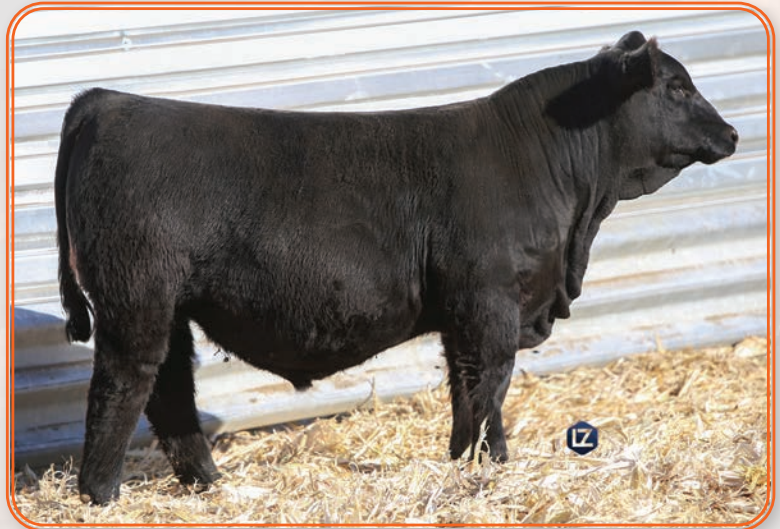
TAG 206 – KRJ K206

Similar to his twin brother, this bull ranks in the top 10% for yearling weight, weaning weight, and ribeye. In addition, he has a 4.13 ADG.