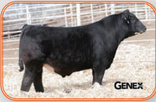
TJ FROSTY 318E SIRE LOTS 18-20

These Frosty daughters are your moderate framed, high capacity, easy fleshing type! Lot 20 is a maternal sib to K273 bull.