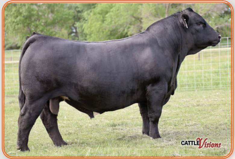
KRJ DAKOTA OUTLAW G974 – SIRE

This bull ranks in the top 10% for YW, WW, and REA. Twin to 206 and their dam posts 105 WW ratio on 4 calves and sells as lot 40.