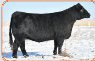
DOUBLE J MISS T739 – DAM OF LOTS 11-14

LOTS 11-14: These bred heifers are the last of the legendary T739 donor who was recognized as one of the most prolific donors by the ASA. T739 has topped the sale here for many years and was known for her unmatched growth. Full sibs to Lot 12 have topped previous sales as bulls and bred heifers. Bred up to our Golden Book herd sire who has 12 EPDs in the top 15% and 7 in the top 5%. These females and matings are stacked with great genetics!