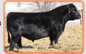
RUBYS TURNPIKE – SIRE LOT 2, 3 & 4