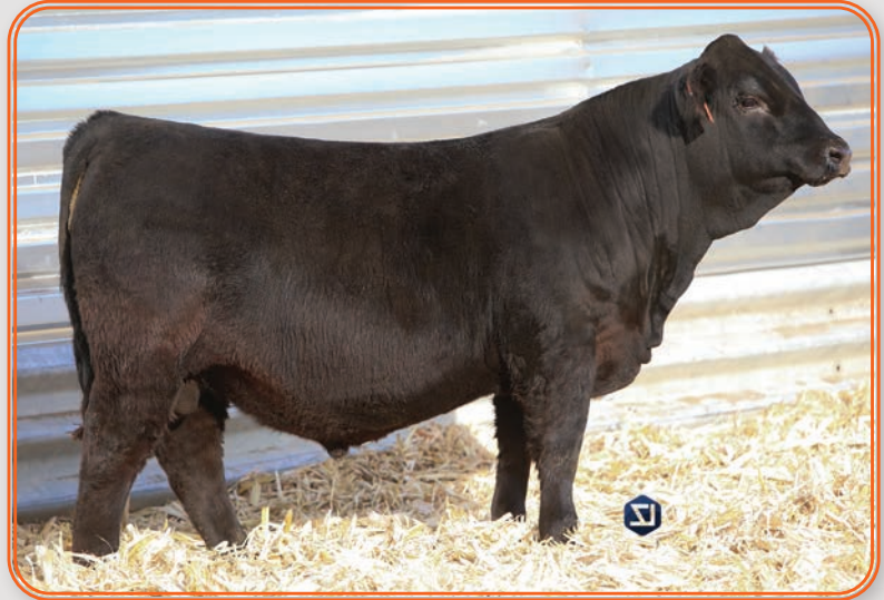
TAG 285 – KRJ K285

This bull has been easy to find in the pasture or in the lot. This standout came in the #1 YW and #1 WDA of 4.44! His dam sells as lot 16 and grandam sells as lot 15.